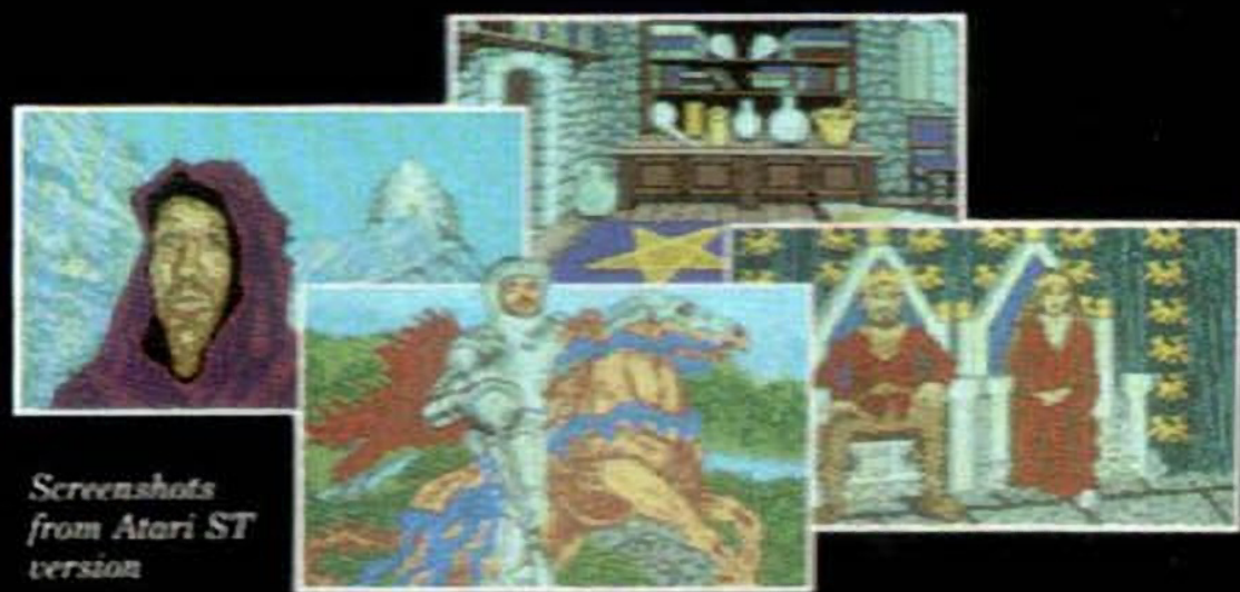
Screenshots from Atari ST version

The challenge which has fascinated treasure hunters through the centuries is now yours — and you'll need all your strength, wit and valour to achieve your goal.